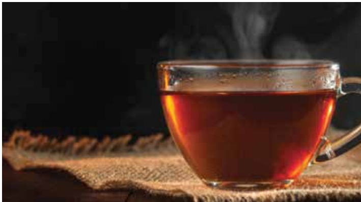
CITRON GREEN TEA